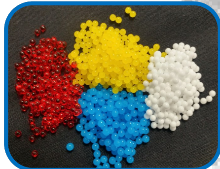
Core Shell Monosphere