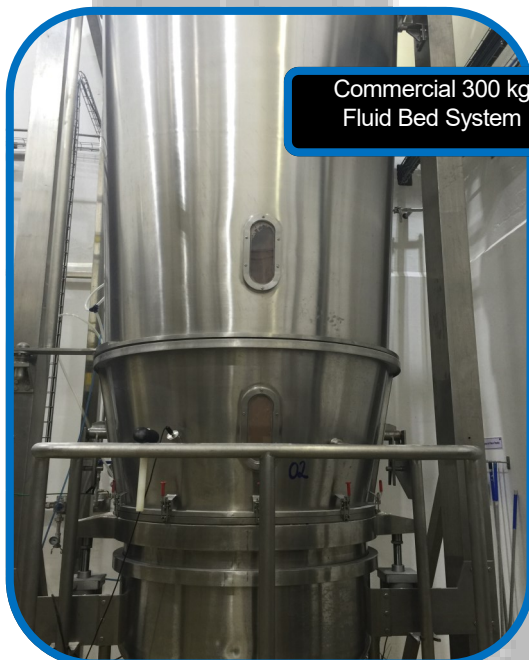
Commercial 300 kg Fluid Bed System